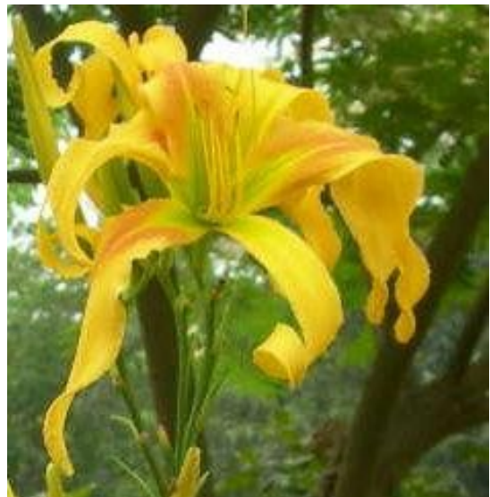
Dances with Giraffes, 2005