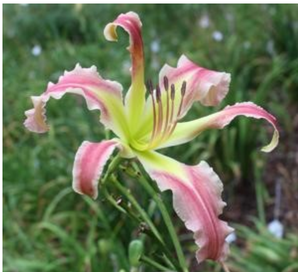
Garden Fairy, 2018