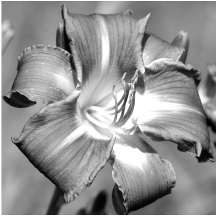
'Hakuna Matata'