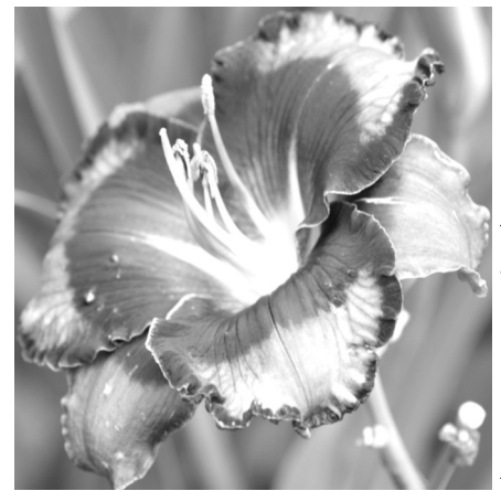
'Storm Shelter'