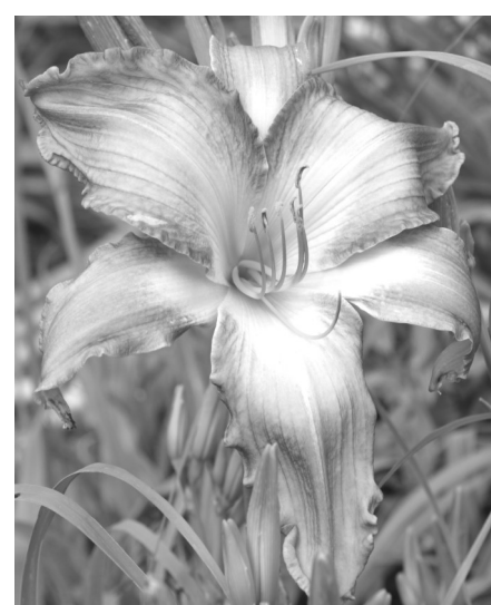
'North Wind Curly Joe'