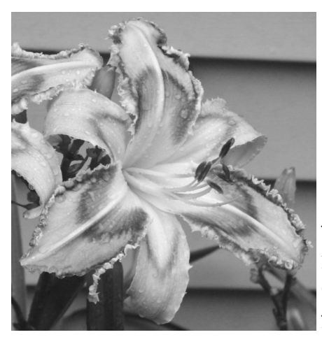
'Entwined in the Vine'