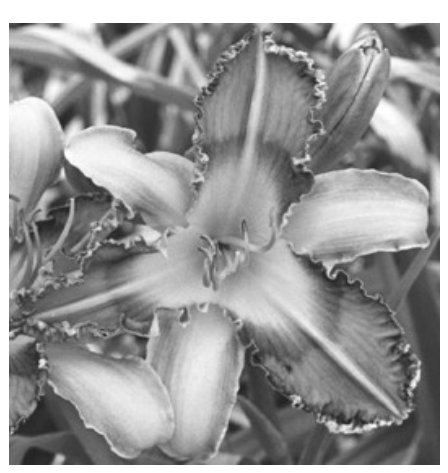
'Captain Jack'