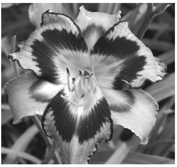
'Intelligent Design'