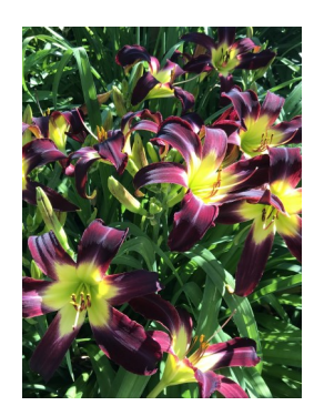
Multiple Bloom Winner: Aliens In The Garden