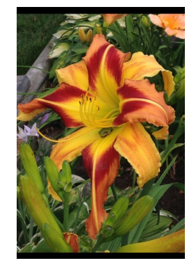
Single Bloom Winner: Love & Dazzle