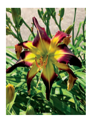
Cultivar Single Stem Karol Emmerich Scarlet Pimpernel