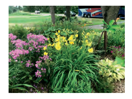
Barb Bazajicek, East Bethel