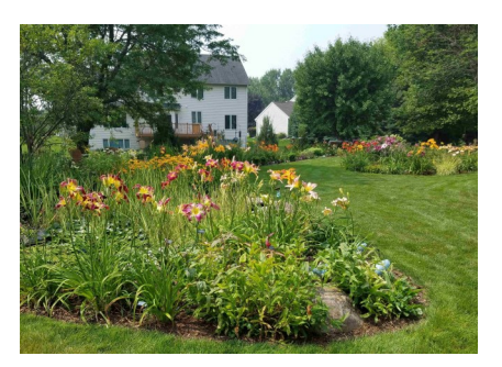
Daylilies in the Landscape