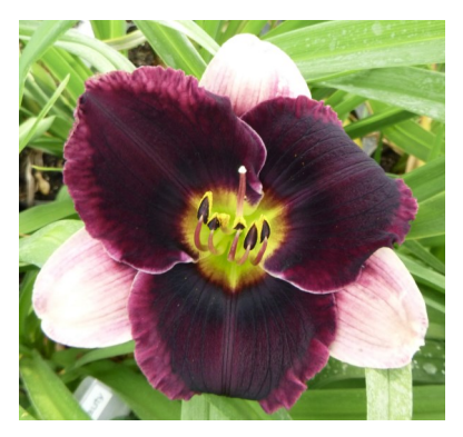
Kathleen Nordstrom for Blackberry Beauty