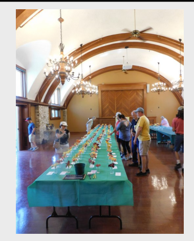
Off Scape Show-Arboretum