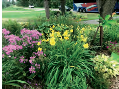
Barb Bazajcek, East Bethel