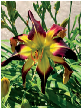
Cultivar Single Stem Karol Emmerich Scarlet Pimpernel